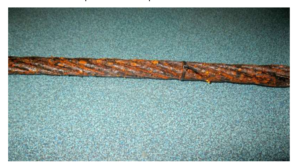
Green cable tie - CorrosionX Heavy duty sample after 168 Hrs NSS.

Black cable tie – Imported wire sample after 168 Hrs NSS.