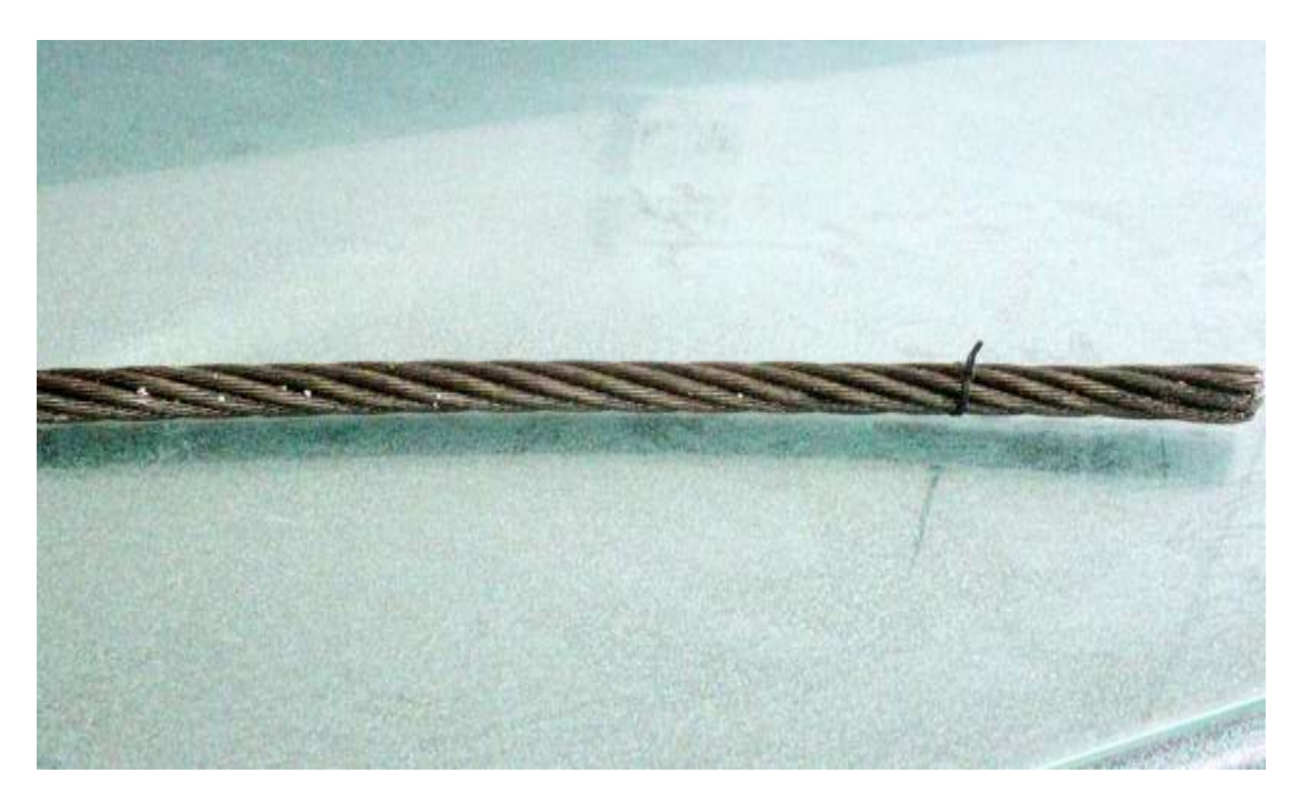
Green cable tie - CorrosionX Heavy duty