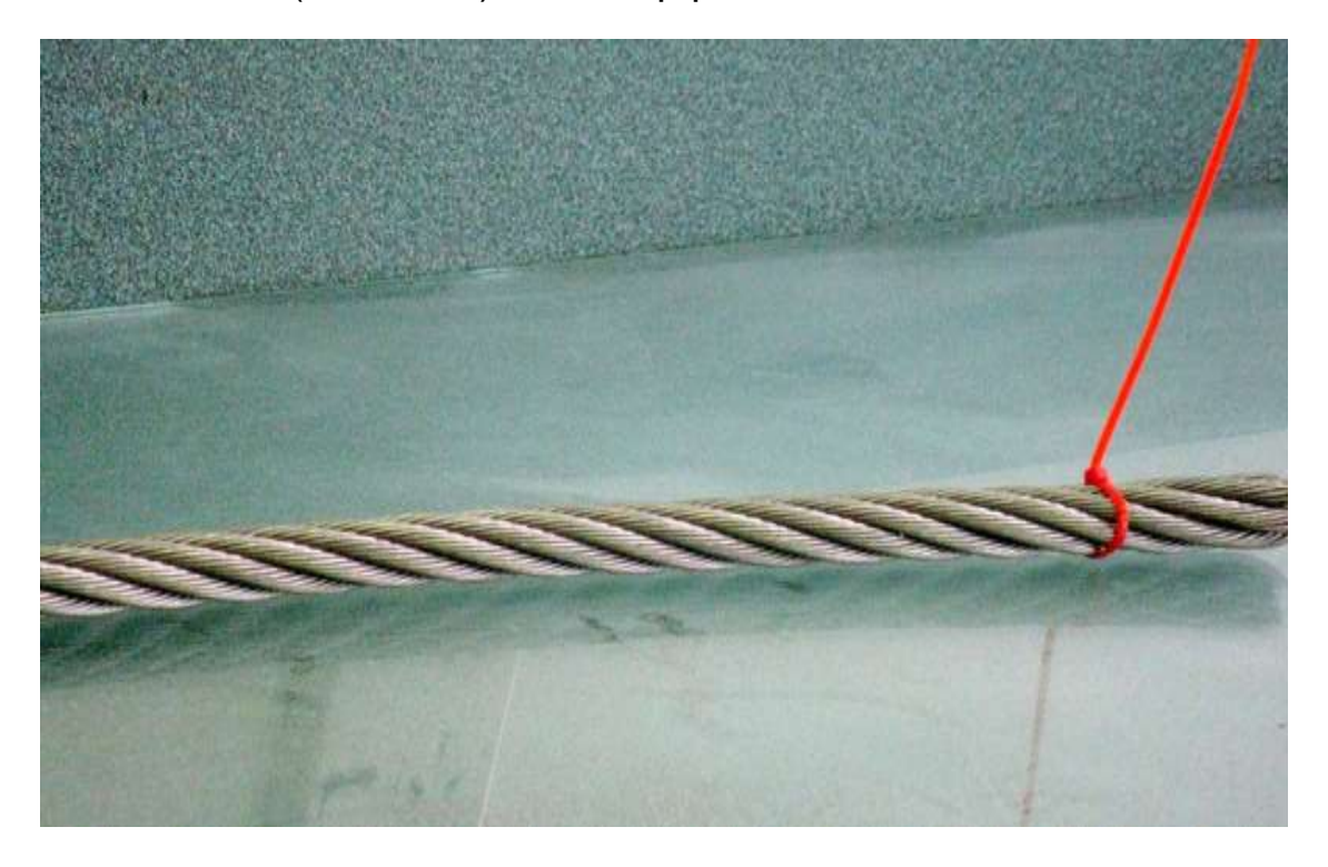
Black cable tie – Imported wire.

Red cable tie (reference): Close up picture.