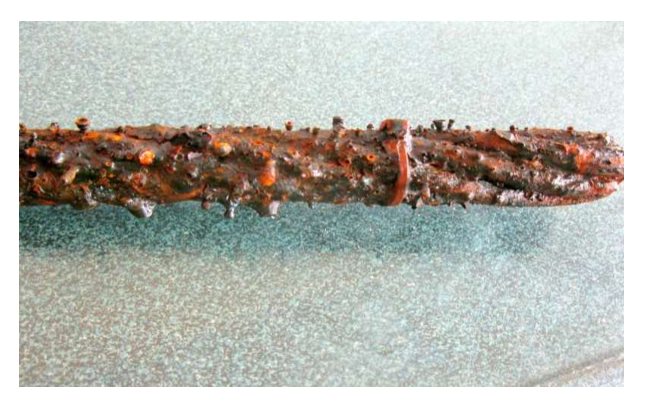
Green cable tie – CorrosionX Heavy duty sample after 1000 Hrs NSS.

Red cable tie – reference sample after 1000 Hrs NSS.